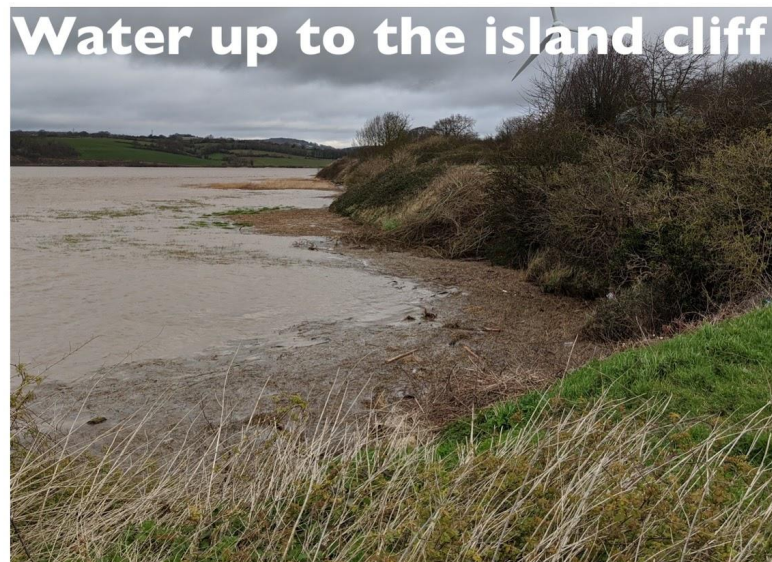
Sharpness Dock area around spring high tide without storm surge