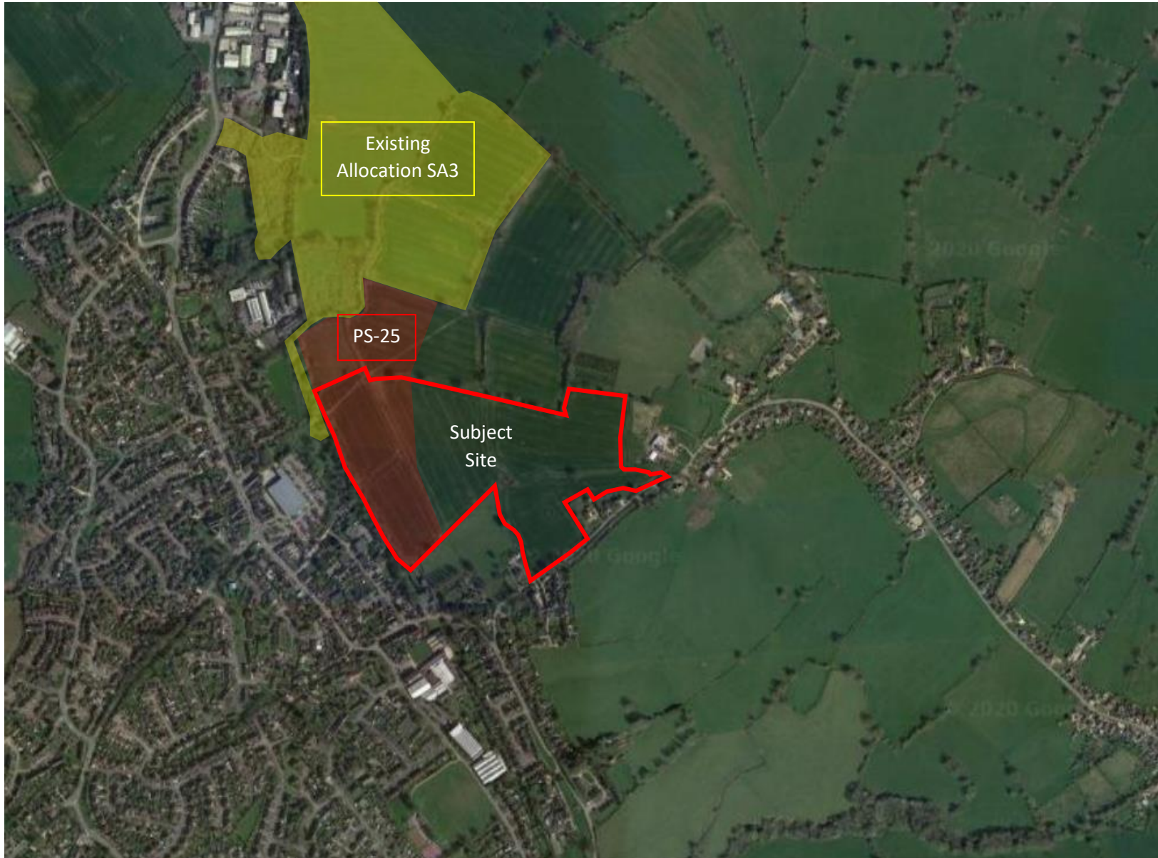
Land on the North West Side of Upthorpe, Cam, Dursley