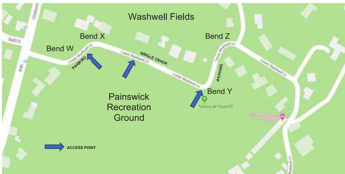
Map of Lower Washwell Lane

We wish to register our strong objection to any plan to build on Washwell Fields with access via Lower Washwell Lane on the grounds that any increase in traffic will make the lane even more hazardous than it already is.