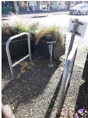
Two bike racks, bike pump station and planters