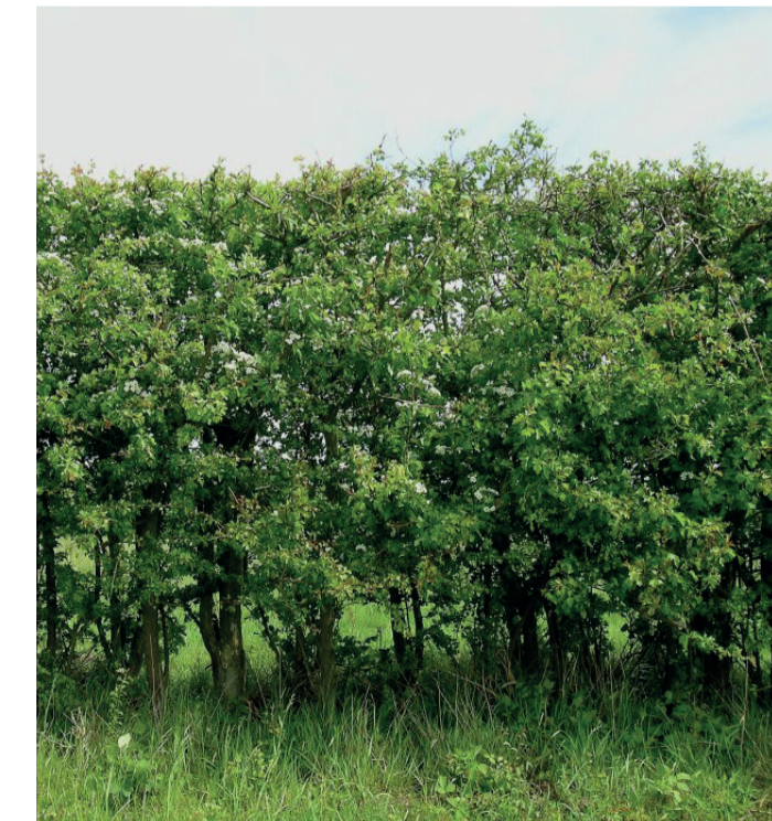
FIELD MAPLE HEDGE